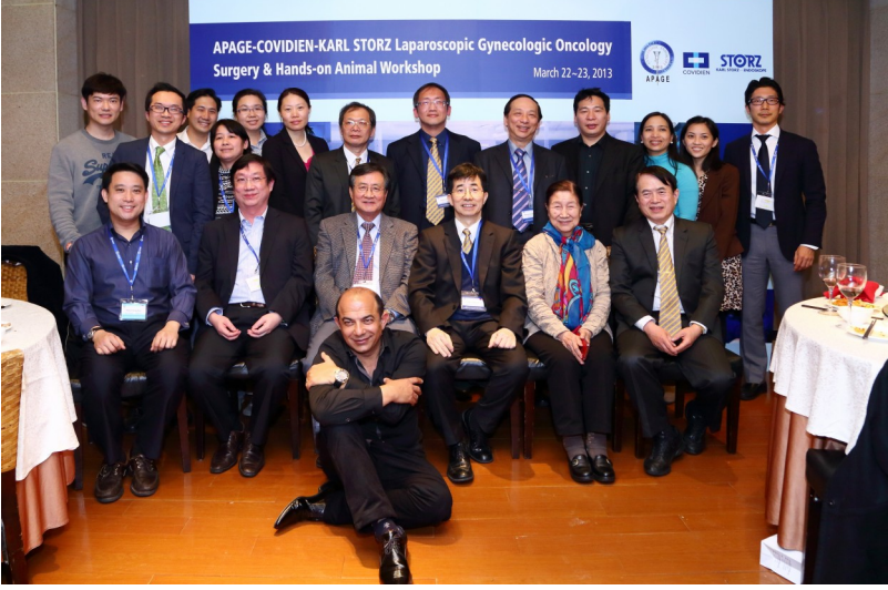
Faculty Group photo

• APAGE Regional Meeting with 3rd IGES National Scientific Meeting, Bandung, Indonesia (23-26 May 2013)