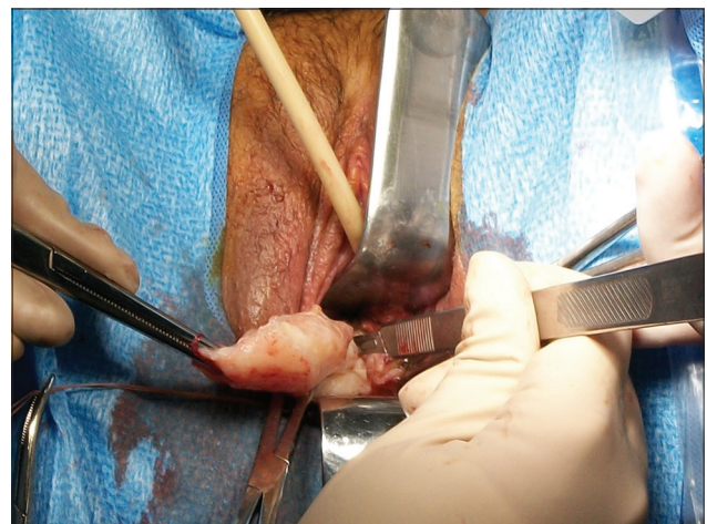
Figure 2: Vaginal morcellation of aborting fibroid