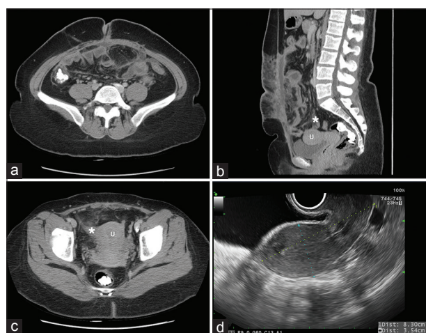
Figure 1: Image studies of the patient. (a) Coronal view of computed tomography of the abdomen. Note severe adhesions between the intestine and abdominal wall. (b) Sagittal view of computed tomography of the abdomen. Star sign showed intestine adhered to the right posterior surface of the uterus. U: Uterus. (c) Coronal view of the abdomen showing the uterus and surrounding structures. (d) Transvaginal ultrasonography of the uterus showing the internal structure and size.

After first published case series of hysterectomy through transvaginal NOTES by Su et al. in 2012, [4] much research has gone into exploring the techniques and feasibility of NOTES hysterectomy in patients with benign uterine diseases, including total vaginal NOTES hysterectomy, [1] vaginally assisted NOTES hysterectomy, [9,10] and robot-assisted NOTES hysterectomy. [11] Limitations of transvaginal NOTES