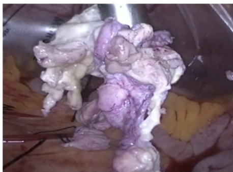
Figure 1. Contained morcellation within a pseudopneumoperitoneum keeping surrounding organs away from the operating field.

Contained morcellation intends to improve the safety profile of power morcellation by reducing the risk of dissemination. The